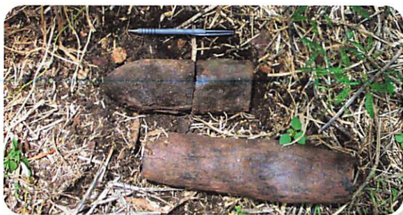
Example of medium caliber munitions

Because explosive hazards associated with military munitions from past military activities may remain at the Gun Emplacements and Range Fans area, the U.S. Army Corps of Engineers recommends that landowners and visitors follow the 3Rs of Explosives Safety – Recognize, Retreat and Report.